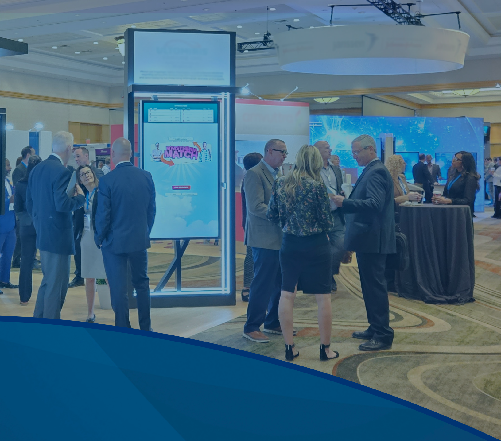
Exhibit & Sponsorship Opportunities Oct. 15-18, 2024 | Savannah, Georgia